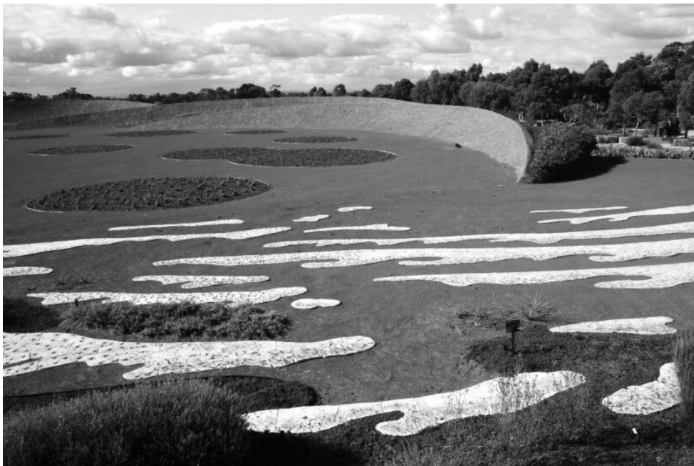
Australian Garden Cranbourne Botanical Gardens

Email: caseycc@casey.vic.gov.au www.casey.vic.gov.au